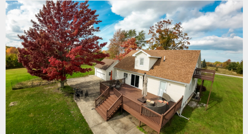
Serenity by the Vines Geneva, OH