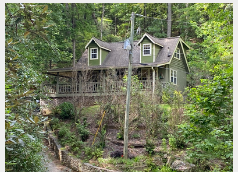
Falling Waters Clayton, GA